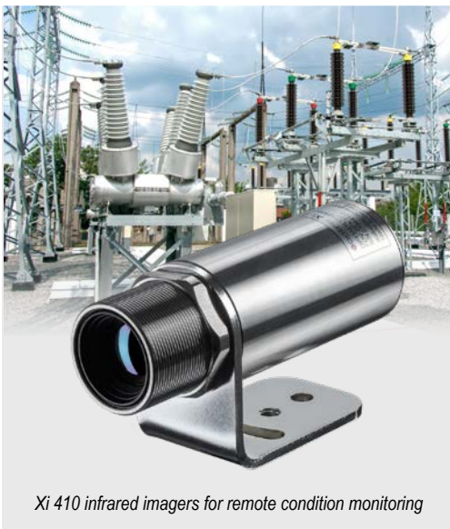
Xi 410 infrared imagers for remote condition monitoring