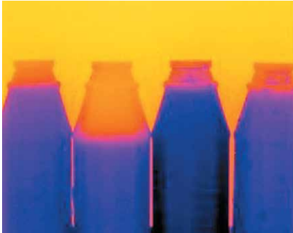
Detecting liquid levels in visually opaque bottles.

The FLIR Ax5-Series of thermal imaging temperature sensors offers comprehensive visual temperature monitoring for process control/quality assurance applications as well as condition monitoring and fire prevention. The A35 and A65 integrate seamlessly into existing systems and are the only thermal imaging temperature sensors on the market to provide temperature linear output through GenICam™ compliant software.