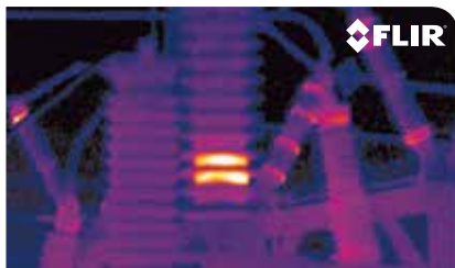
Thermal image of a substation.

The FLIR A310 can be ordered already built into an environmental housing. The housing increases the environmental specifications of the FLIR A310 to IP66, without affecting any of the camera's features. It is ideal when the camera needs to be installed in dusty or wet environments. The housing is available for A300 cameras that are equipped with 7, 15, 25, 45 or 90° FOV lenses. Users that want to build the camera within the housing themselves or that already have a FLIR A310 that needs extra protection against dust and water can order the housing separately as an accessory.