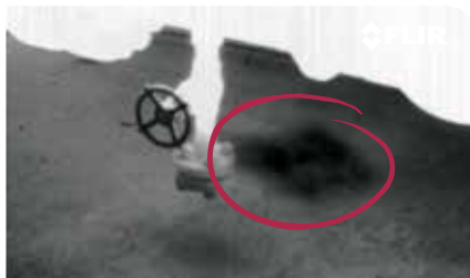
Captured gas leak from production site.

Benzene, Ethanol, Ethylbenzene, Heptane, Hexane, Isoprene, Methanol, MEK, MIBK, Octane, Pentane, 1-Pentene, Toluene, m-xylene, Butane, Methane, Propane, Ethylene and Propylene.