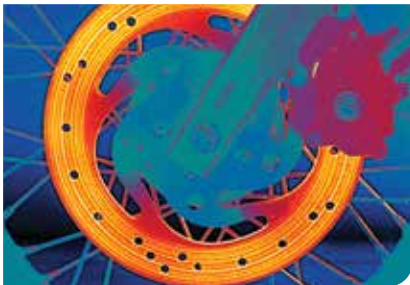
Motorcycle disc brake system